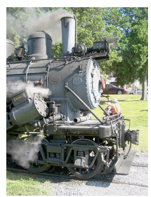
The front of Climax #3.