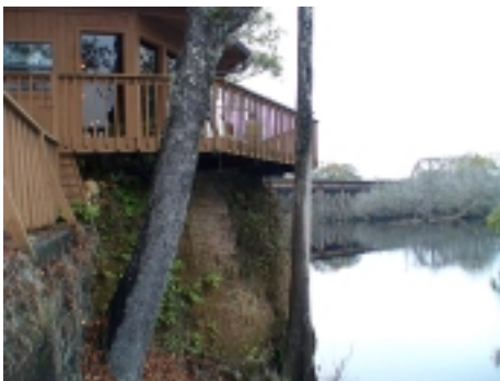
View of trestle from lower deck