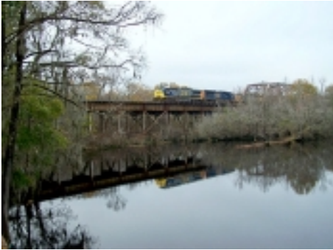
From the Deck – View of a Southbound Freight