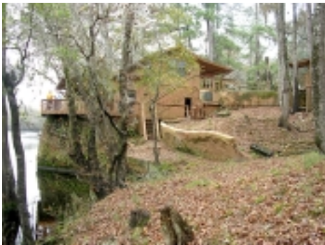
Northwest side view of trestle house