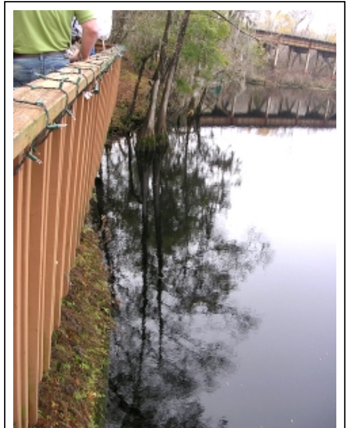
View facing west from below the trestle house.