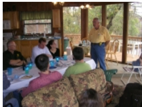
We had fun and talked business