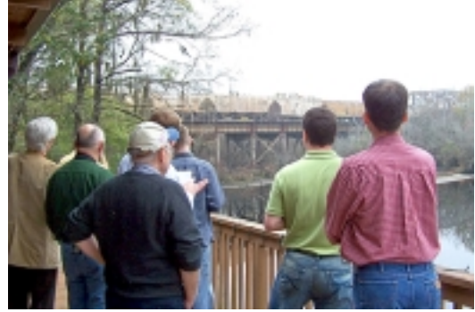
Members watch a Northbound Freight