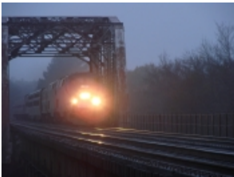
Southbound Silver Meteor early in the morning