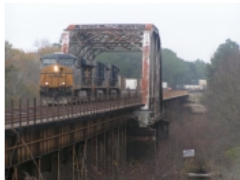
Southbound CSX Intermodal