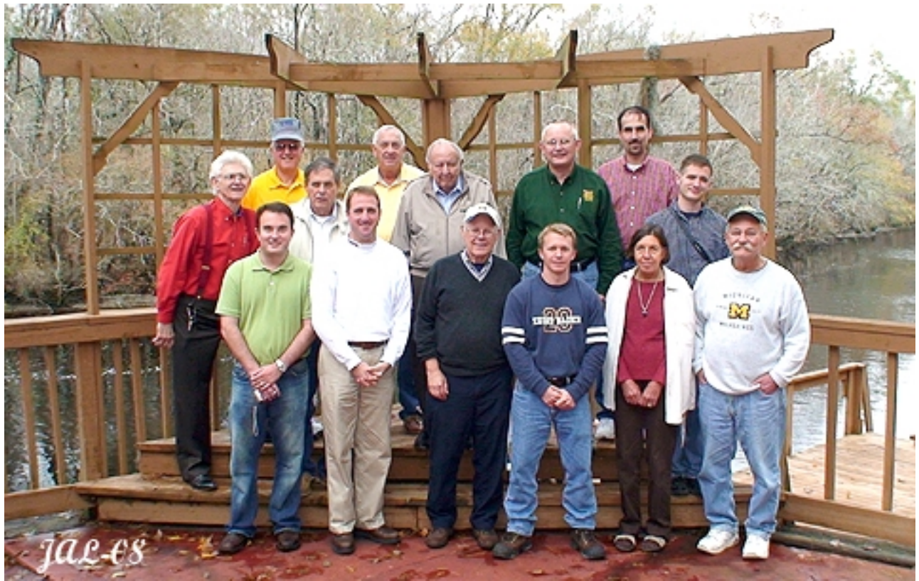
Southeast Chapter members pose for the official photo on the deck of the Trestle House