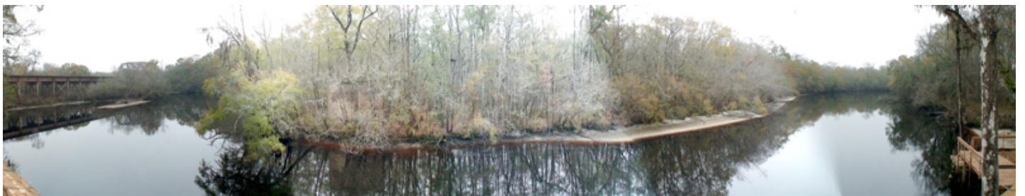
Multiple images joined for a panorama off the deck at the Trestle House & St. Mary's river, left/west, right/east

1910 Negative No. 3243 Baldwin Locomotive Works. Class 10 36 D 565 Road No. 43 Built for Seaboard Air Line Railway Co. Class T - 80 - K Cylinders 21" x 28" Driving Wheels 72" Passenger Engine Weight 173,700 # Total Weight 295,000 #