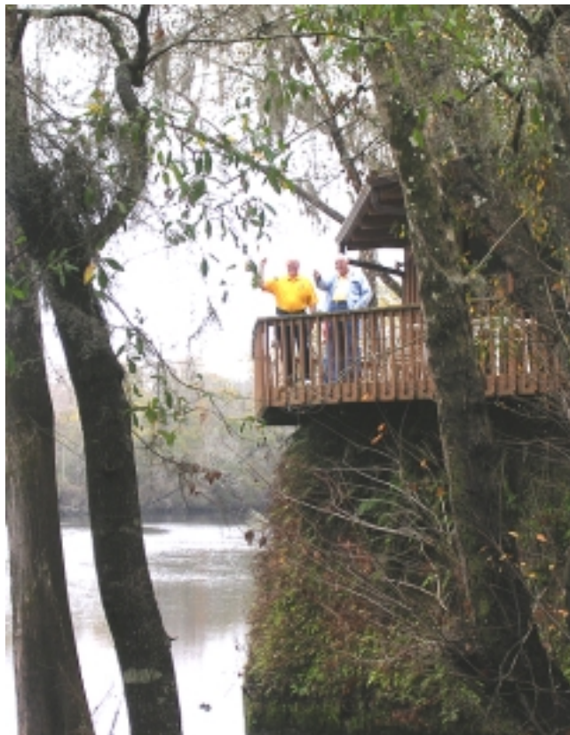
View facing east from below the trestle house.