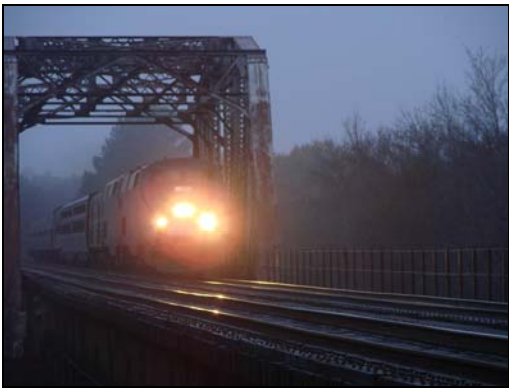
Southbound Silver Meteor early in the morning