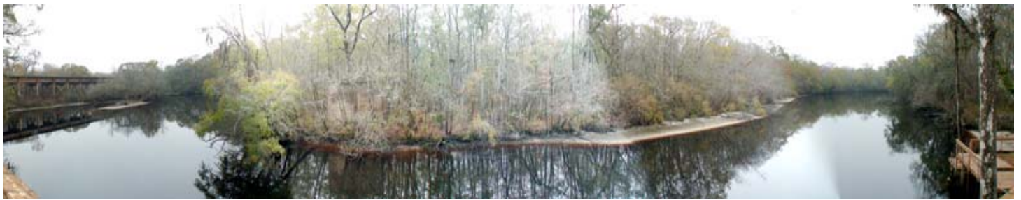
Multiple images joined for a panorama off the deck at the Trestle House & St. Mary's river, left/west, right/east

1910 Negative No. 3243 Baldwin Locomotive Works. Class 10 36 D 565 Road No. 43 Built for Seaboard Air Line Railway Co. Class T – 80 – K Cylinders 21" x 28" Driving Wheels 72" Passenger Engine Weight 173,700 # Total Weight 295,000 #