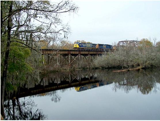
From the Deck – View of a Southbound Freight