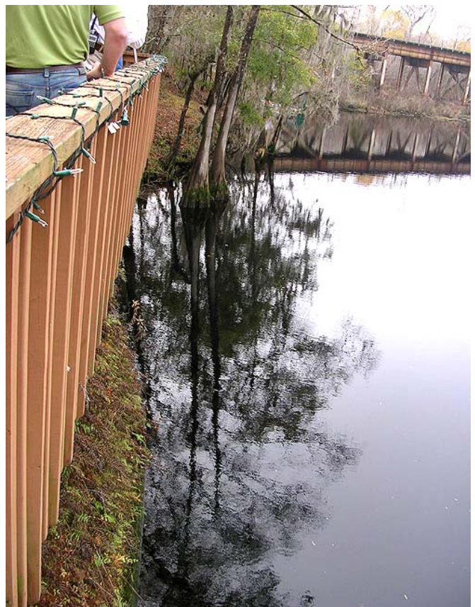
View facing west from below the trestle house.