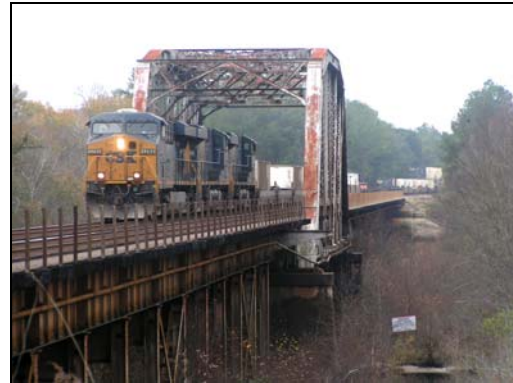
Southbound CSX Intermodal