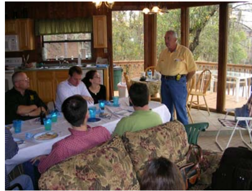
We had fun AND talked business