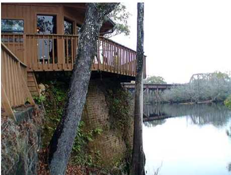
View of trestle from lower deck