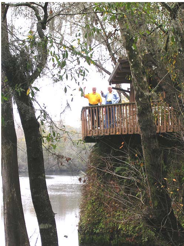
View facing east from below the trestle house.