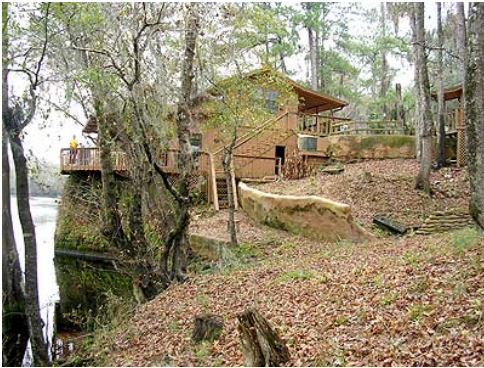
Northwest side view of trestle house