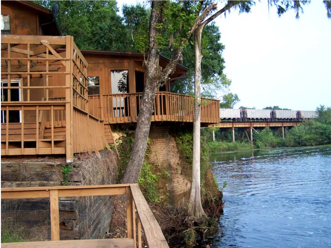
The river side view of the trestle house showing the old bridge abutment below the deck, with a CSX freight train crossing the St. Marys river.