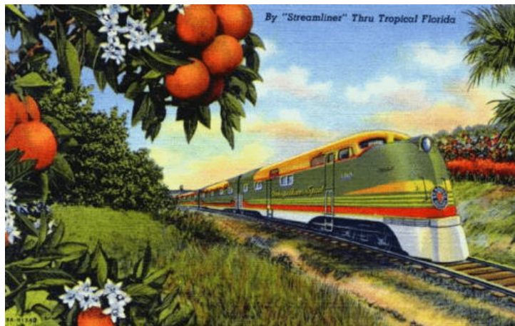
Postcard of the Seaboard's Orange Blossom Special