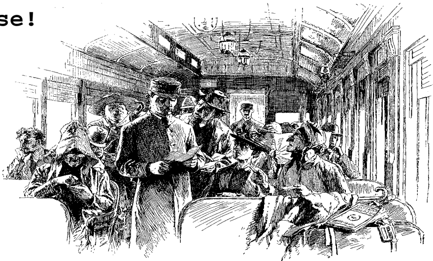
Scribner's Monthly, 1888