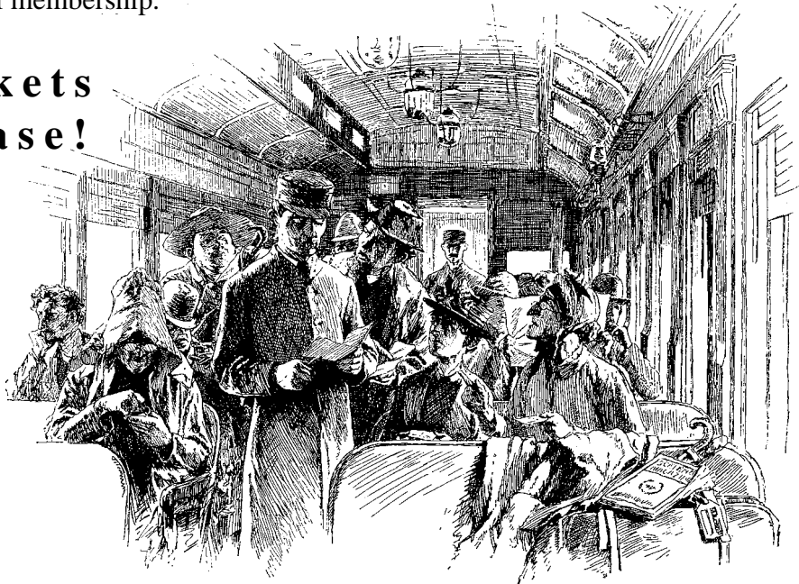
Scribner's Monthly, 1888